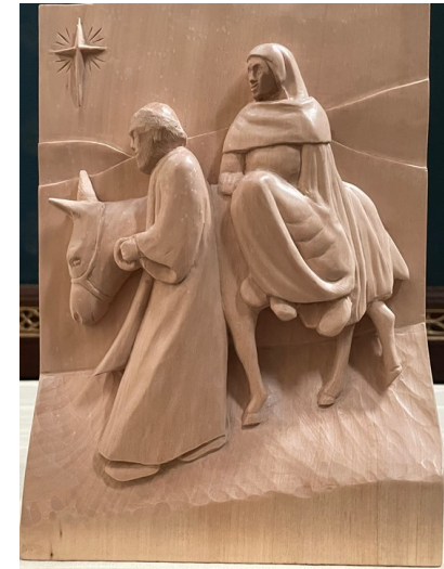
St Michael's Posada or travelling crib

Despite good intentions we get pulled in different directions as the world around us gets caught up in the Christmas rush. Even Advent calendars have become more about expensive treats rather than following the story of the birth of Jesus with added chocolate.